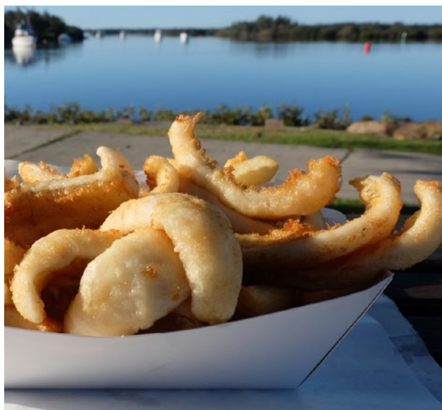
Fish and chips taken from Tea Gardens overlooking the Myall Lakes.

For more information on the program, including eligibility and how to apply for funds, please visit Supporting Seafood Future .