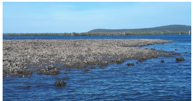
Remnant Sydney Rock Oyster Reef - Port Stephens.

For more information, contact contact.us@marine.nsw.gov.au