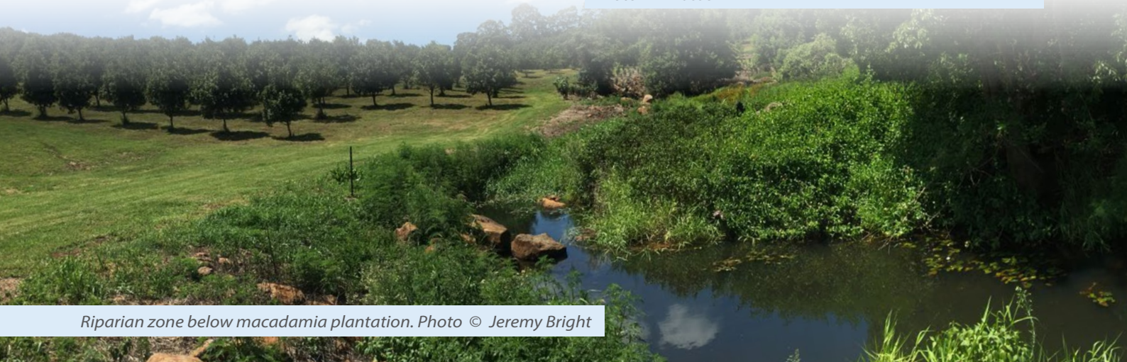
Riparian zone below macadamia plantation.