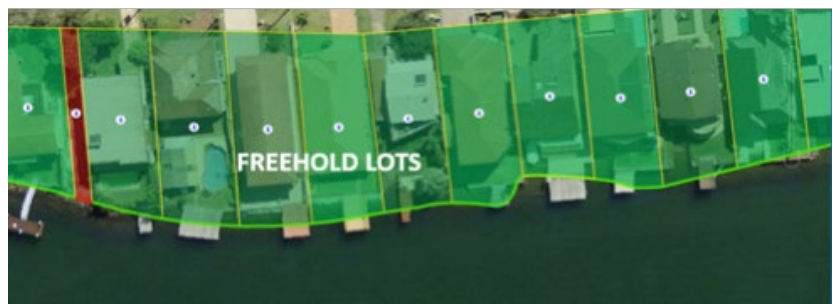
Figure 3b. Example of freehold lots, adjacent to the waterfront, where no other criteria listed in Table 3 apply