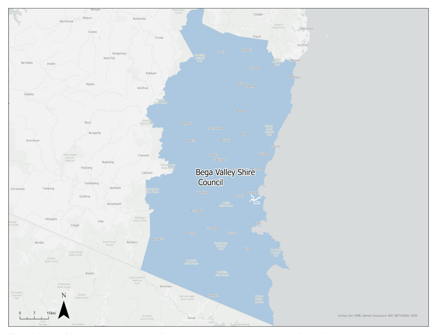
Figure A 2. map of this strategy's estuary waterfront assessment area depicted as a white line within the local government area.

Bega Valley Shire Council administer the local planning framework including for areas along the waterfront of the Pambula River estuary as determined by their LEP (Figure A2). The zoning of the land, controls, guidelines for proposed developments, development standards and other relevant development matters are established under the LEPs and DCPs.