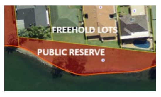
Figure 3a. Example of Crown land public reserve adjacent to the waterfront