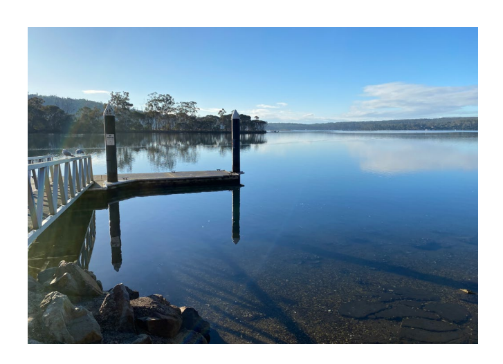
Table 2 includes design requirements for specific structures, for instance, boat ramps and slip rails need to conform to the natural shape of the riverbank if they are to be considered for LOC. Jetties need to be on piles and solid fill jetties are unacceptable. See section 4 for more information about design guidelines.

Note: the DWF Guidelines describe the listed items as 'domestic waterfront facilities'. This strategy uses the term 'domestic waterfront structures' because only a subset of facilities covered by the DWF guidelines are managed by this strategy.