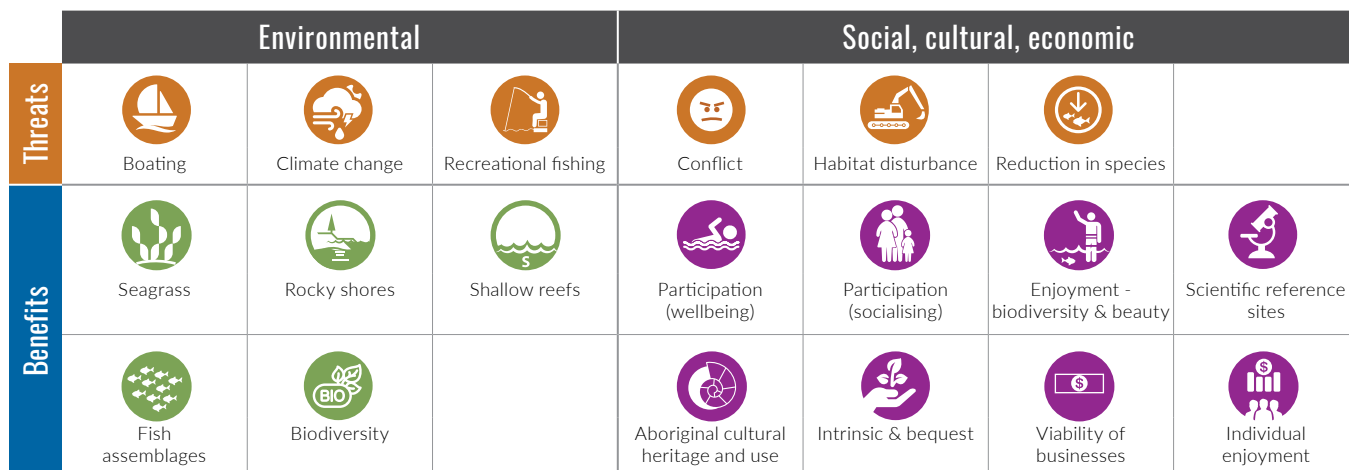
Table 45. Threats and expected benefits

The high environmental value of Shiprock was identified by peak conservation stakeholders – the National Parks Association of NSW and the Nature Conservation Council of NSW. Submissions generally identified this site as an important dive site, including for its easy land access for divers. Sutherland Shire Council supported additional protection at this site.