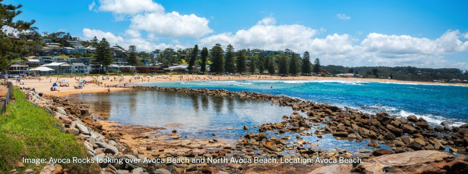
Image: Avoca Rocks looking over Avoca Beach and North Avoca Beach. Location: Avoca Beach

“Visiting the ocean and bushland by the beach energises me, is great for my mental and physical health and provides a great free family activity.”