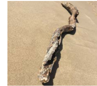
Driftwood