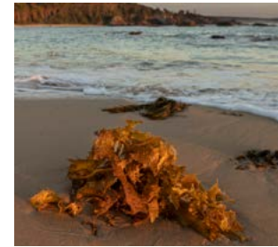
Seaweed, Mystery Bay