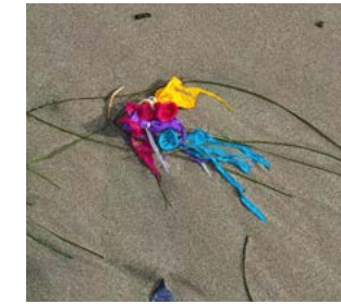
Balloon debris