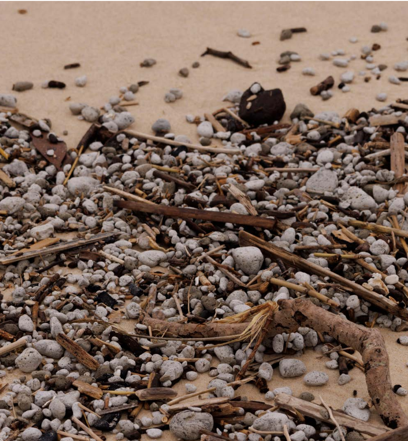
Driftwood and pumice stone NATURAL