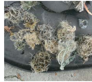
Fishing line collected from beach