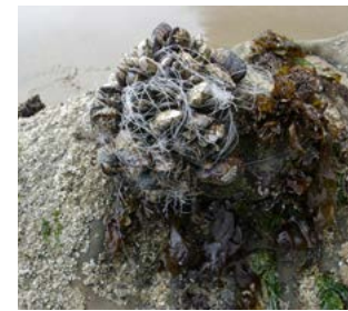
Fishing line