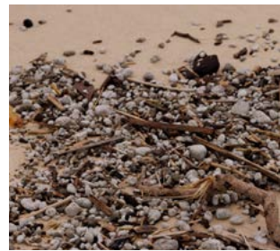
Driftwood and pumice stone