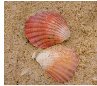
Scallop shells Kelly Coleman/PeeKdesigns