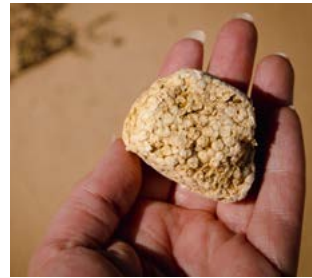
Polystyrene