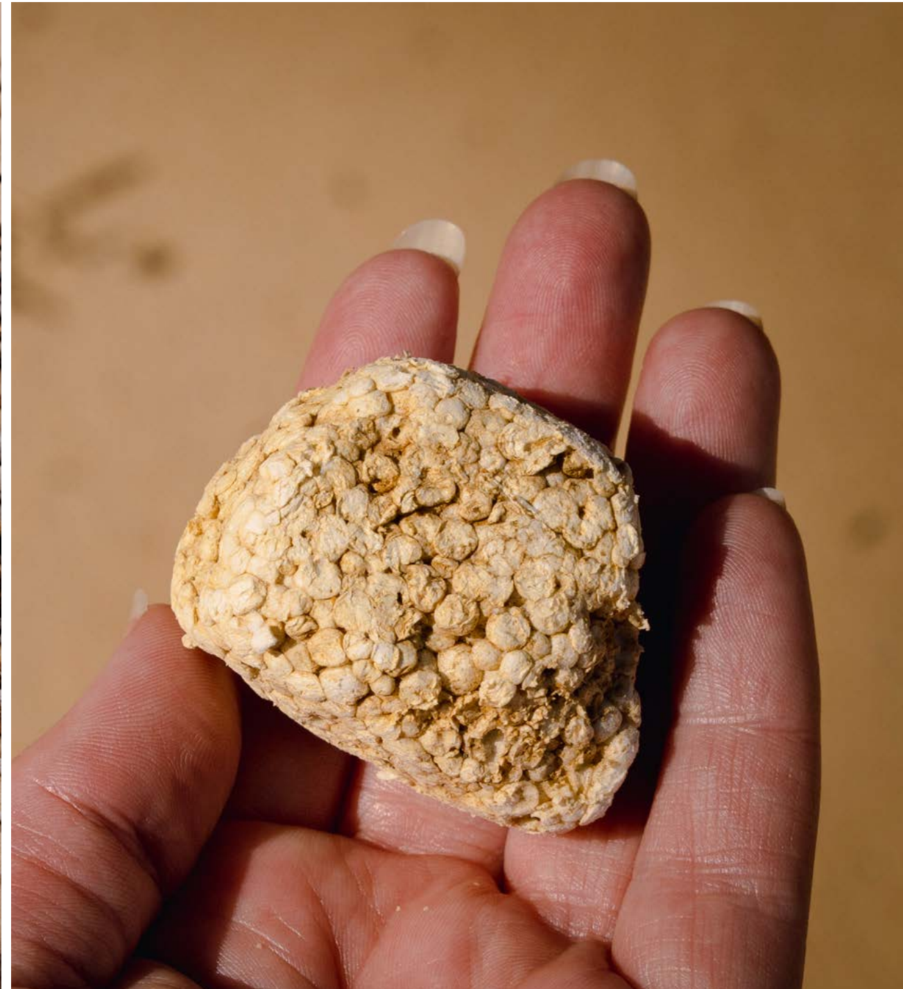
Polystyrene NOT NATURAL