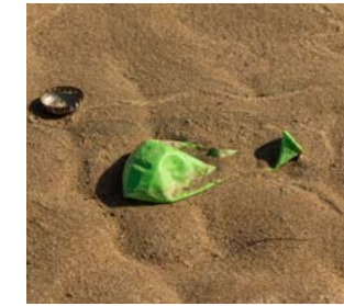
Balloon and bottle cap Kelly Coleman/PeeKdesigns