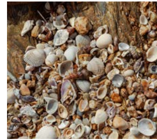
Shells Kelly Coleman/PeeKdesigns