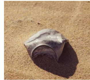
Can in sand