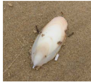
Cuttlefish bone Kelly Coleman/PeeKdesigns