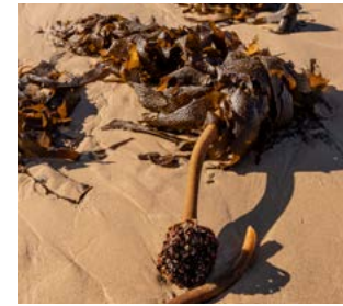
Seaweed Kelly Coleman/PeeKdesigns