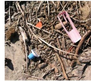
Plastic waste DPI