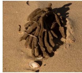
Sponge Kelly Coleman/PeeKdesigns