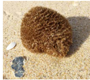
Sponge Kelly Coleman/PeeKdesigns