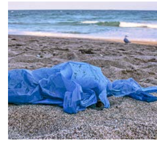
Plastic bag on the beach

© State of New South Wales through the Department of Regional NSW, 2023. This resource has been prepared for schools. You may copy, distribute, display, download and otherwise freely deal with this publication for any purpose, provided you attribute the Marine Estate Management Authority as the owner.