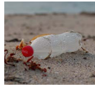
Plastic bottle on beach