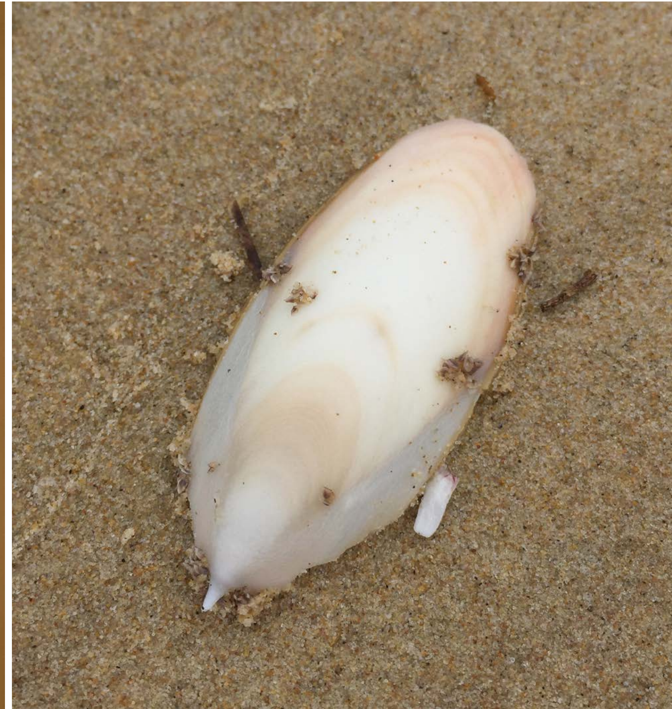
Cuttlefish bone NATURAL