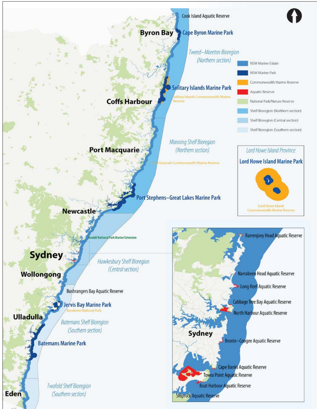
Map 1 NSW marine estate

The NSW marine estate covers the coastline, estuaries and marine waters in NSW out to three nautical miles off the coast (map 1). It stretches approximately 1,250 kilometres along the eastern coast of Australia. It includes coastal lakes, lagoons and over 750 beaches. The NSW marine estate is home to an extensive variety of marine life, ecosystems and natural resources. It is a valuable asset that supports the social, economic and environmental well-being of NSW (Figure 2).