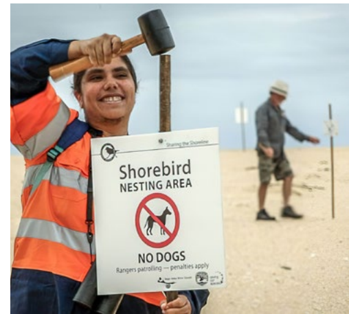
Right: National Park Ranger and Aboriginal Ranger. Below: School students showcasing their Return and Earn project